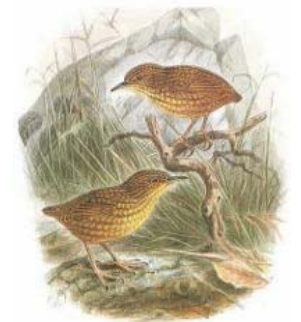
Stephen's Island Wren