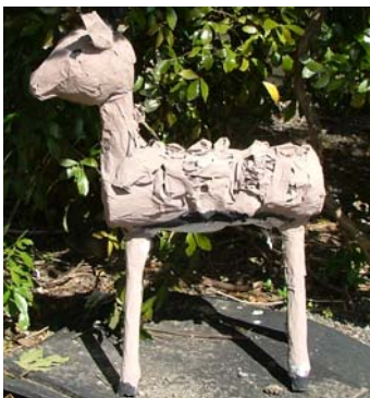
Giselle piñata with meat in its belly