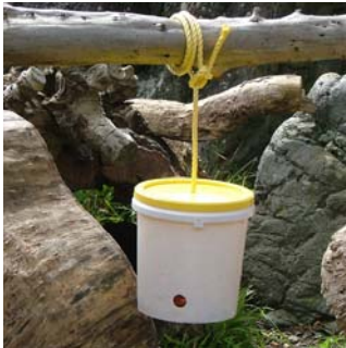
Bucket containing fruit with small hole in the base