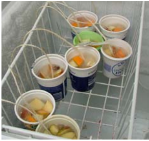
Frozen fruit blocks

Try and match up the type of enrichment with the right animal