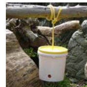
Bucket containing fruit with small hole in the base