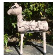
Giselle piñata with meat in its belly