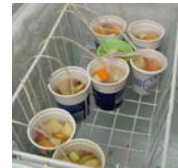
Frozen fruit blocks

Try and match up the type of enrichment with the right animal